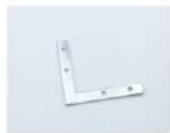
90 degrees connector