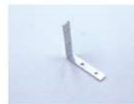
Inside 90 degrees connector