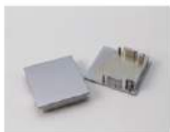
End cap without hole