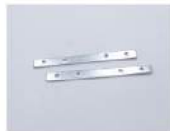
180 degrees connector