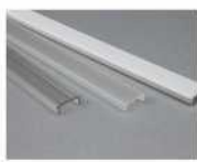
PMMA opal matte cover PMMA semi-clear cover PMMA clear cover PC diffused cover