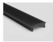
Black PC cover