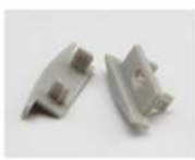
End cap with hole End cap without hole