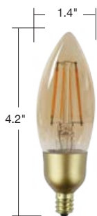
LFB11C4025KAD LFB11C6025KAD 3.5/5W Dim B11 Amber Deco

Input Line Voltage: ..... 120 VAC Input Power ..... See Chart Input Line Frequency ..... 50/60HZ Minimum Starting Temp ..... -20°C Maximum Operating Temp..... 40°C CRI ..... 80