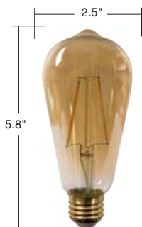
LFST2525KAD LFST4025KAD 2.7W Dim ST19 Amber