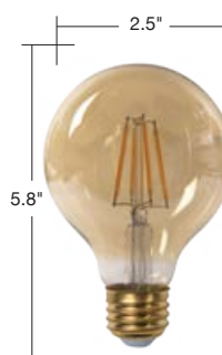
LF6254025KAD LF6256025KAD 3.5/5W Dim G25 Amber