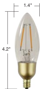
LFB11C4027KDAB LFB11C6027KDAB 3.5/5W Dim B11 Clear Deco