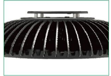
Fin Type Heat Sink