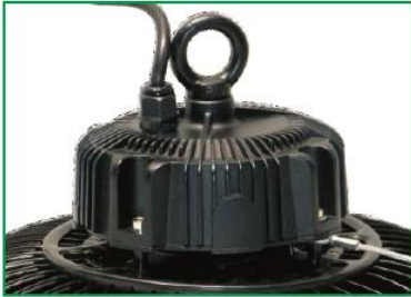
MEAN WELL Power Supply